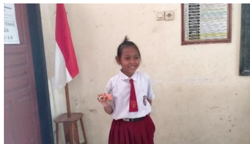
Figure 3. Students tell about the objects they brought

SDN Canggung 1 are ready with the existing objects with objects from home according to the teacher's orders. During the learning process, students are disciplined and follow the teacher's directions well. Grade 2 students at SDN Canggung 1 take turns coming to the front of the class and telling stories about an object. Students who do not speak listen to what their friends have to say. During the question and answer session, many students asked questions so that the learning process was active. Even though it was the first time for students, the students actually showed their enthusiasm in participating in learning. This is an indication that the show and tell method is quite successful in improving the speaking skills of grade 2 students at SDN Canggung 1.