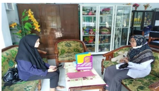
Figure 1. Interview process with the homeroom teacher of SDN Canggung 1

was felt that it could increase students' interest and speaking skills. The show and tell method is felt to increase students' learning motivation because in its application it can take advantage of any object that students want, both in the form of favorite objects and objects around them to be displayed and told. By using objects they like, students become excited in telling stories. The application of the show and tell method also makes it easier for students to convey ideas, thoughts, and feelings related to a thing or object that is displayed. This is expected to improve students' public speaking skills.